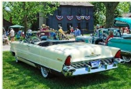
1956 Lincoln Premiere - Jamaican Yellow

However, owning one was financially impossible. I was 16 years old and my total lifetime earnings didn't reach $4600.00 until I reached the age of 22.