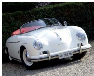
Porsche 356 a 1600 Super Speedster

Porsche, began in 1948 with a two-seat model 356 powered by a "1.1 litre centre" engine delivering 40 HP. This was followed by the 352/2 models which today are considered priceless. The 356 Porsches became well known for their racing prowess with both individual and factory cars participating in races like the LeMans 24 Hour Race and the Targa Florio in Sicily. Unlike the Lincoln, I don't remember hearing of Porsche until the