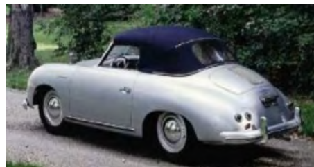
1955 Porsche 356/2

Porsche, began in 1948 with a two-seat model 356 powered by a "1.1 litre centre" engine delivering 40 HP. This was followed by the 352/2 models which today are considered priceless. The 356 Porsches became well known for their racing prowess with both individual and factory cars participating in races like the LeMans 24 Hour Race and the Targa Florio in Sicily. Unlike the Lincoln, I don't remember hearing of Porsche until the