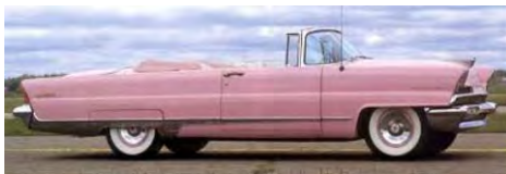
1956 Lincoln Premier - color Island Coral