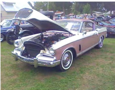
Our 1956 Golden Hawk

After settling in, we took a tour around the field to see all the beautiful cars.