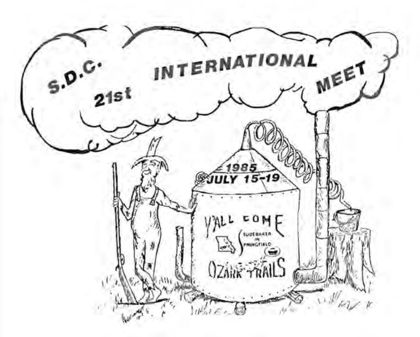
Springfield Meet A Big Success!

P.O. BOX 5041 . SPRINGFIELD, MISSOURI 65801-5041