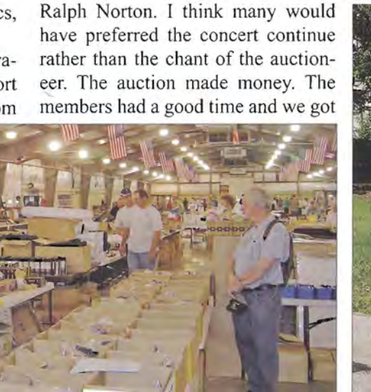
At one of the inside swap meet buildings at the fairgrounds.