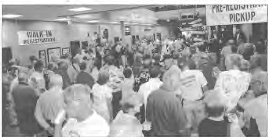
Part of the crowd at the Welcome Night in the Studebaker National Museum.