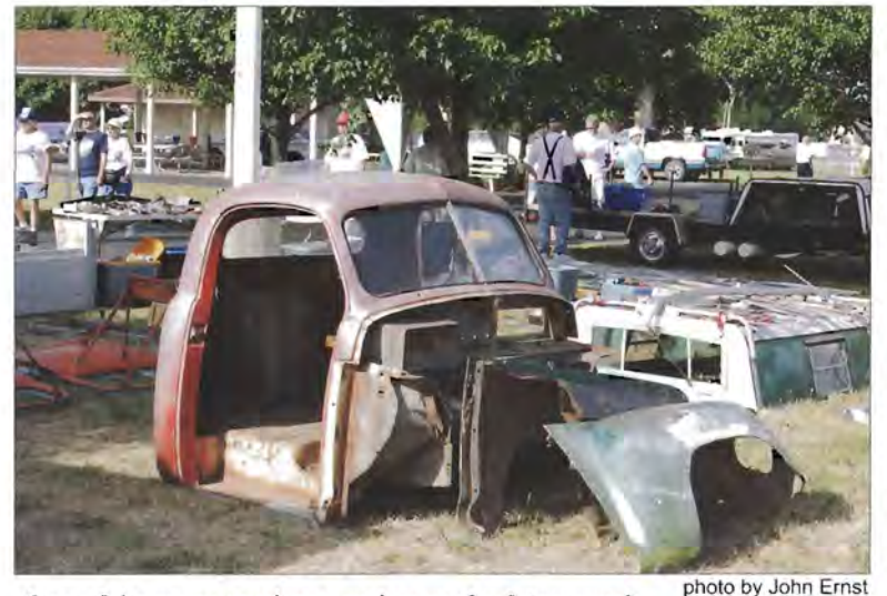
One of the many outdoor vendors at the fairgrounds.

gram, featuring fashions from the eighteenth century to