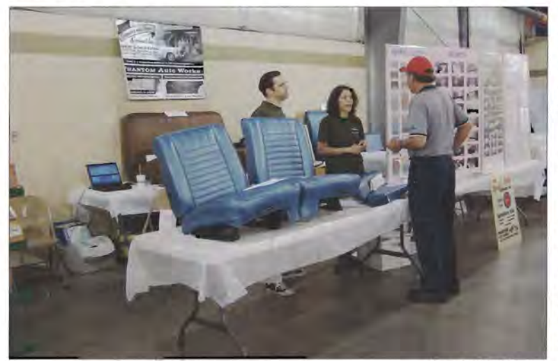
Phantom Auto Works at the swap meet.