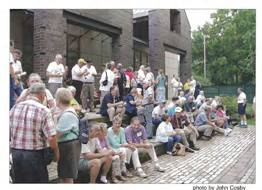
Ice cream and much socializing at Monday's Welcome Night.