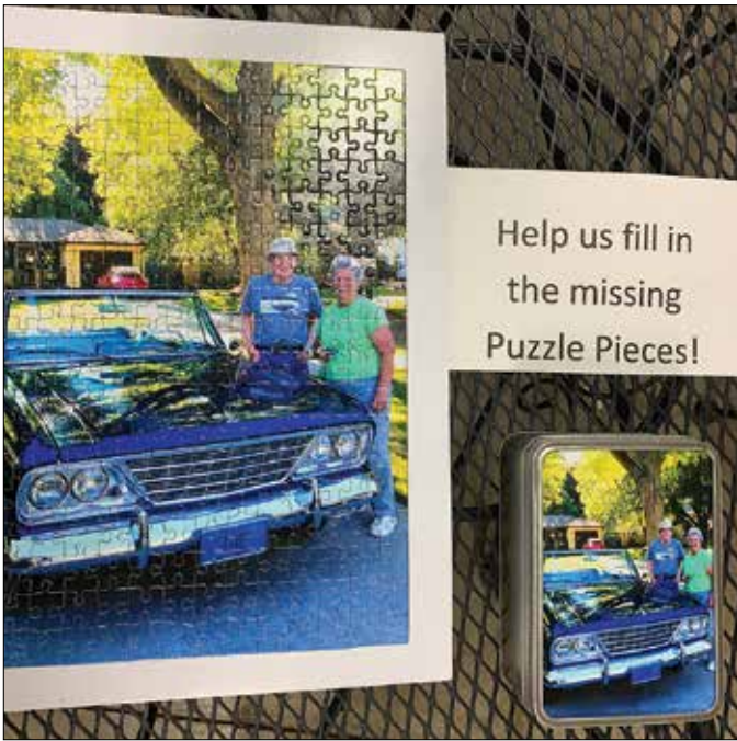
One of the jigsaw puzzles on the tables in the hospitality area.

I was the auctioneer at the SDC club auction that was held on Thursday night. I am not, nor will I ever be, a professional auctioneer. The only experience I have had is that I was the auctioneer for our church fundraising auction for a number of years. I had a good time and we sold about 60 items. The auction generated about $2200. Thanks to all who donated items and all who participated in the auction.